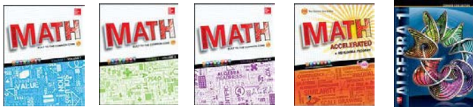
Course 1 @2015 Course 2 @2015 Course 3/PreAlgebra @2015 PreAlgebra @2015 Algebra 1 @2014